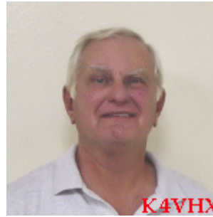
Editor/Publisher: Vic Emmelkmp-K4VHX

We moved the date to January to accommodate more members who come back after Holidays and usually December is a busy month for all of us. So let us have a good showing and have a good time with our Ham Buddies for the Holidays.